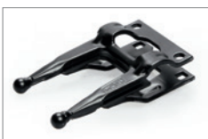
Guard ball tips