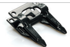
Extra short guards