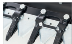
ProCut knife section