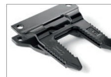
SCH AxeCut guard