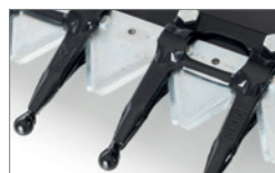
ProCut knife section