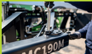
Width adjustment attachment