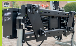
Düvelsdorf D-Lock system