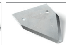
SCH AxeCut section